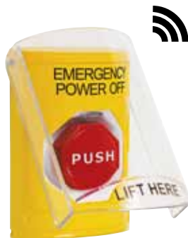
Stopper® Station Shield (Cover 2, A)

Covers to protect your STI Stopper Station from damage or weather and to help stop malicious or accidental activation.