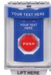
Universal Stopper® (Covers 3, 4, 7, 8)

No labeling can be placed on the Stopper Station shield.