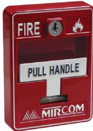
MS-701IDU Intelligent Addressable Single Action Manual Station