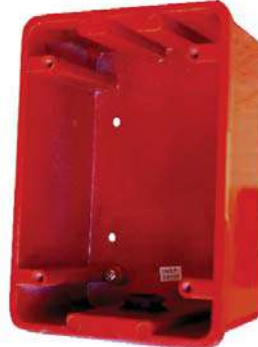
BB-700WP Weatherproof Surface Mount Backbox