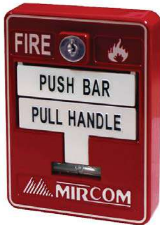
MS-710IDU Intelligent Addressable Dual Action Manual Station