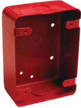
BB-700 Surface Mount Backbox