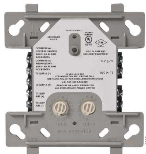
MMF-300(A) (Type H)

Use to monitor a zone of four-wire smoke detectors, manual fire alarm pull stations, waterflow devices, or other normally-open dry-contact alarm activation devices. May also be used to monitor normally-open supervisory devices with special