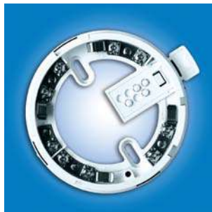
MIX-2000 Intelligent Mounting Base