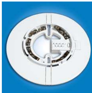
MIX-2001 6" Intelligent EZ-Fit Base