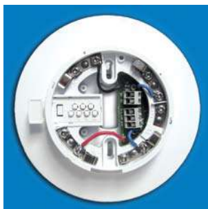
MIX-2001R 6" Intelligent Relay Base