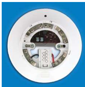
MIX-2001HT 6" Intelligent Sounder Base