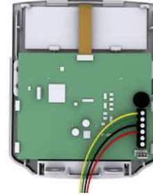
Figure 4: Wiring