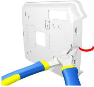
Figure 2: Surface-mount cabling plastic tab removal