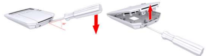
Figure 1: Opening the K32LCD+