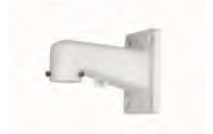
DH-PFB305W Wall mount bracket